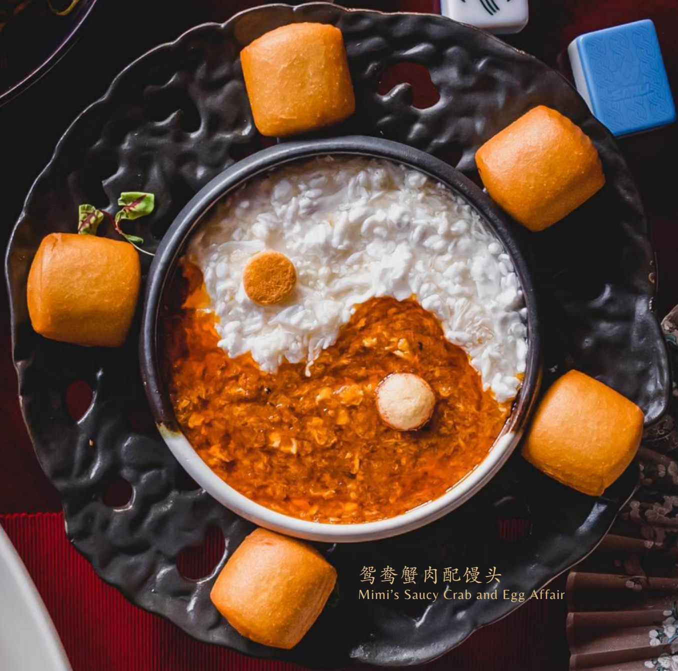
鸳鸯蟹肉配馒头 Mimi's Saucy Crab and Egg Affair