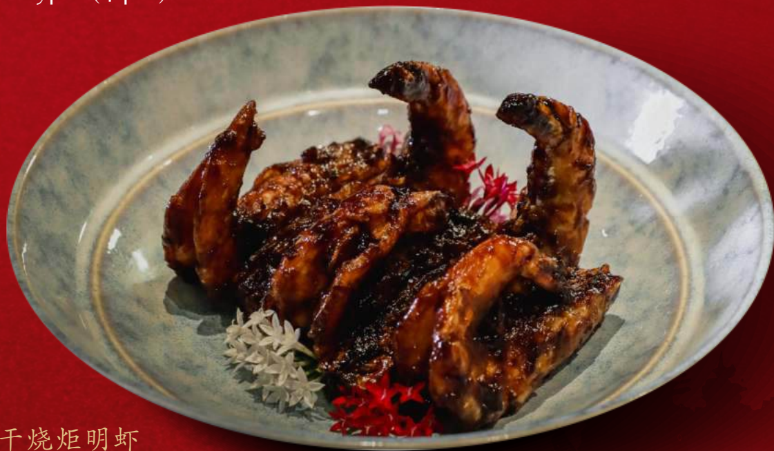
干燒炬明蝦 Baked Prawns in Chef's Special Sauce

多寶魚 (至少2片) (娘惹蒸/金銀蒜/港式蒸) | 16/pcs Turbot Fish (Min. 2 pcs)