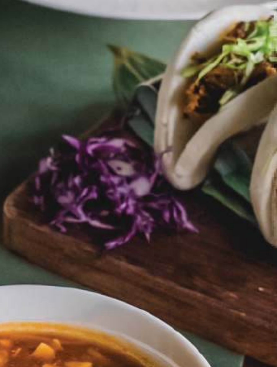
酸辣汤 (素) Sze Chuan Hot & Sour Soup