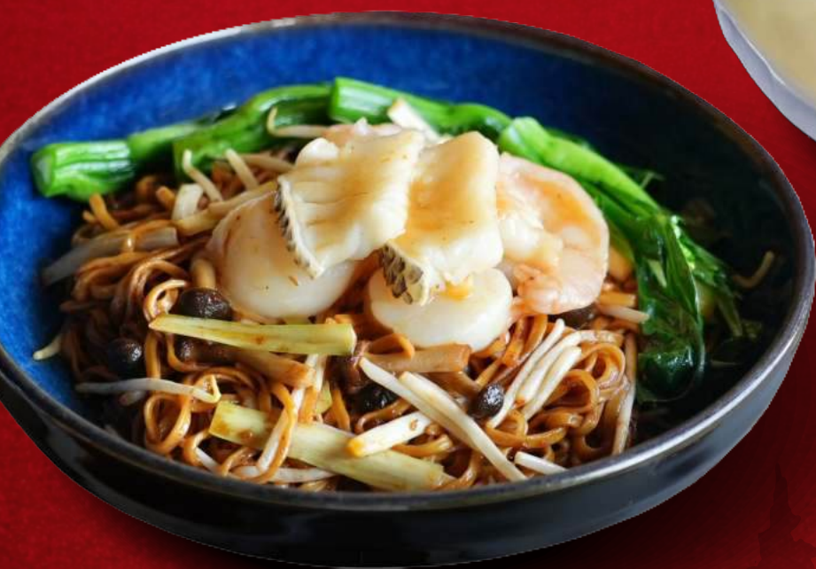
XO海鲜韭王焖伊面 Braised XO Seafood Ee Fu Noodle