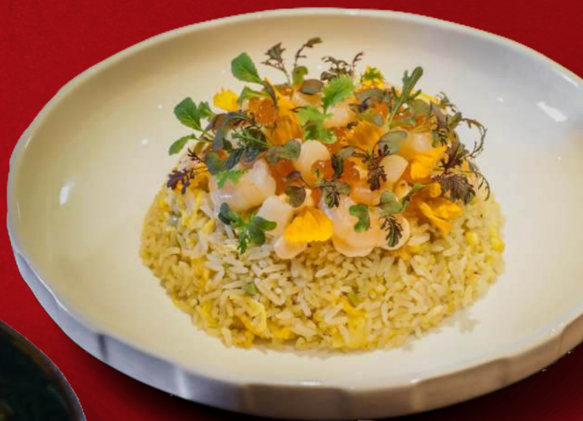
明太子海鲜炒饭 Mentaiko Seafood Fried Rice